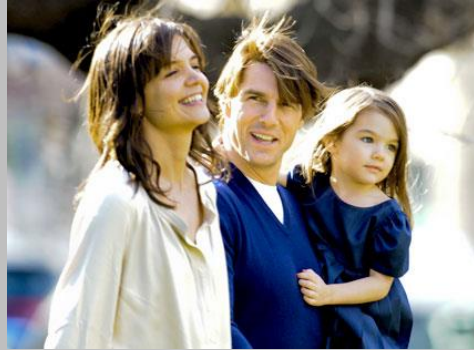
Tom Cruise, Katie Holmes and Suri Cruise

Birthday parties will always have those moments we remember, good or bad. Celebrity parents dish out thousands of dollars to ..... their kid's birthday parties. Imagine being little fashionable Suri Cruise celebrating with actors dressed up as favorite characters and frolicking with animals for a cool $200,000. Most of us can't even remember Suri Cruise second birthday and Suri, now 7, probably didn't either, but Katie Holmes and then hubby,