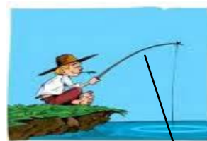
a fishing line

One fine morning, a man was fishing in a river. The sun was shining and the man (sat – was sitting – sit) on the river bank. (Fishing – Fish – Fisher) was his favourite pastime. Everything was very quiet and peaceful. The man was waiting patiently, when suddenly he stood up (quickly – slowly – sadly) and began to take in the line. There (was – were – are) a big fish but it fell back into river. At first, the man didn't know what happened. Then he (looked – look – was looking) carefully at his fishing line. It was empty. The poor man was so (disappointed – happy – satisfied) that he packed away all his things and went home.