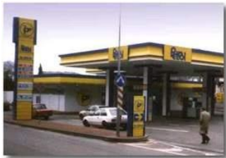
Petrol - Gas Station CCTV can benefit from digital technology

2- After a few seconds , he came back and told the girl she had to come inside because her credit card had been denied . Reluctantly , she walked inside . The old man grabbed her , but she hit him with a can of oil . Then , she ran back to her car and left the old man screaming and waving his arms at her . After driving for a few miles , she turned on the radio and started to relax . As she looked in the rear view mirror , she saw someone popped up at the back seat holding an axe above her head .